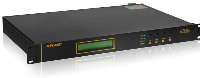
[Figure 1-1] PTS-10 Time Server

The PTS-10 Time Server is a standard time server. It supports high precision reference clock, which can be synchronized to absolute time such as GPS, BDS, and GLONASS etc. Built-in TCXO, OCXO helps to provide stable reference frequency source. System supports multiple sources time sync auto selection algorithm which can perform stable switch between GPS, BDS, GLONASS, IRIG-B, PTP and local clock, and sky/ground and master/slave clock backup. PTS-10 time server provides flexible time output channels and signals. The output timing signals include PPS, PPM, PPH, IRIG-B (Demodulated), IRIG-B (Modulated), Serial Time Signal (TOD etc.) etc. Plus, PTS-10 supports network sync time protocols NTP/SNTP and PTP (IEEE1588 v2). IEEE1588 can works in several modes by the software configuration including grandmaster clock, slave clock and boundary clock. PTS-10 has LCD to show any status and do configuration by keyboard. Meanwhile, PTS-10 is designed to send timing source status and clock status to control center by IEC61850 MMS, IEC60870-T104, DNP3.0, Modbus etc. PTS-10 also supports WEB and SNMP to manage system.