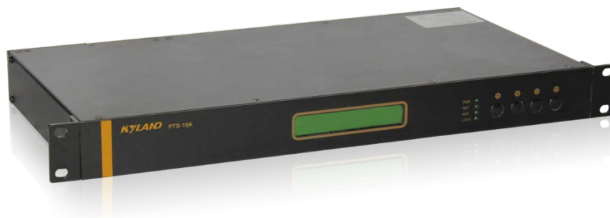
[Figure 1-1] PTS-10A Time Server

The PTS-10A Time Server is a standard time server. It supports high precision reference clock, which can be synchronized to absolute time such as GPS, BDS, and GLONASS etc. Built-in TCXO, OCXO, Rubidium clock helps to provide stable reference frequency source. System supports multiple sources time sync auto selection algorithm which can perform stable switch between GPS, BDS, GLONASS, IRIG-B, PTP and local clock, and sky/ground and master/slave clock backup. PTS-10A time server provides flexible time output channels and signals. The output timing signals include PPS, PPM, PPH, IRIG-B (Demodulated), IRIG-B (Modulated), Serial Time Signal (TOD etc.) etc. Plus, PTS-10A supports network sync time protocols NTP/SNTP and PTP (IEEE1588 v2). IEEE1588 can works in several modes by the software configuration including grandmaster clock, slave clock and boundary clock. PTS-10A has LCD to show any status and do configuration by keyboard. Meanwhile, PTS-10A is designed to send timing source status and clock status to control center by IEC61850 MMS, IEC60870-T104, DNP3.0, Modbus etc. PTS-10A also supports WEB and SNMP to manage system.